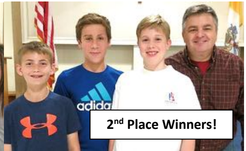
2 nd Place Winners!