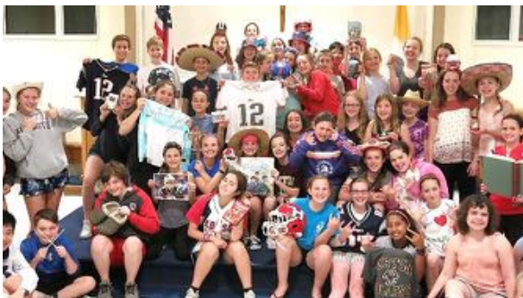
1 st Place Winners!

Open to all 6 th , 7 th , & 8 th Graders for Faith, Friendship, Service & Fun.