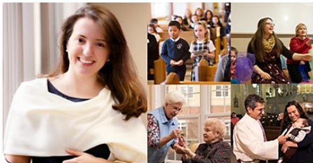
2019 Catholic Appeal ~ "This is Our Church!"

It is worth noting that in the history of our parish, St. Mary's has never before reached her Catholic Appeal goal in only four weeks.