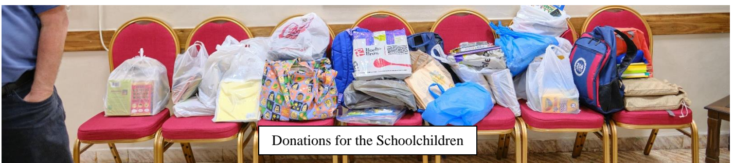
Donations for the Schoolchildren