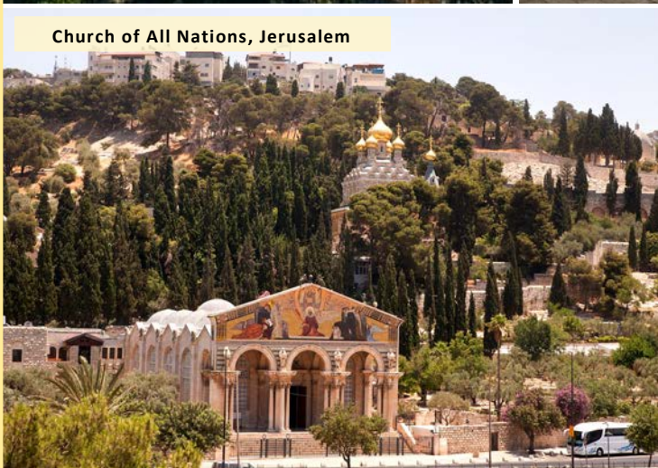
Church of All Nations, Jerusalem