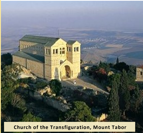
Church of the Transfiguration, Mount Tabor