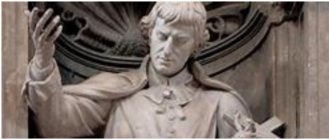
St. Louis Marie Grignon de Montfort

What is outlined above should be so familiar for all of us when we attend Holy Mass. The apostles (the presiders at that time) were the priests that were ordained through the Apostolic Tradition handed down through the ages by Jesus Himself at the Last Supper when He ordained His disciples as priests. Jesus Gave His authority to these men and said, "Do this in remembrance of Me." The Mass is a perpetual gift of God's endless and generous grace that will lead us to the heavenly banquet promised by Christ.