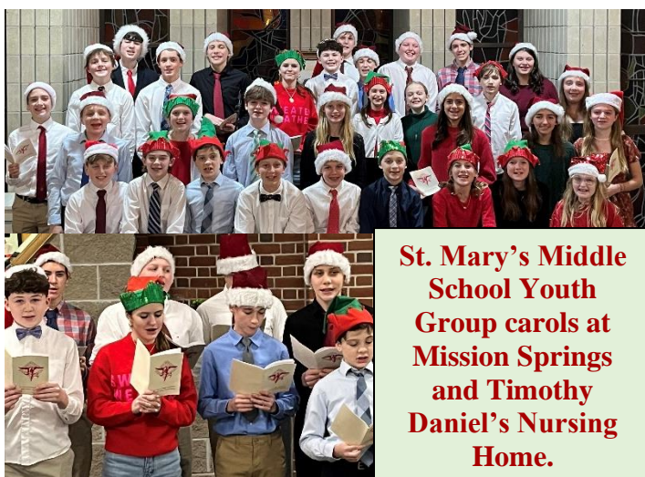
St. Mary's Middle School Youth Group carols at Mission Springs and Timothy Daniel's Nursing Home.