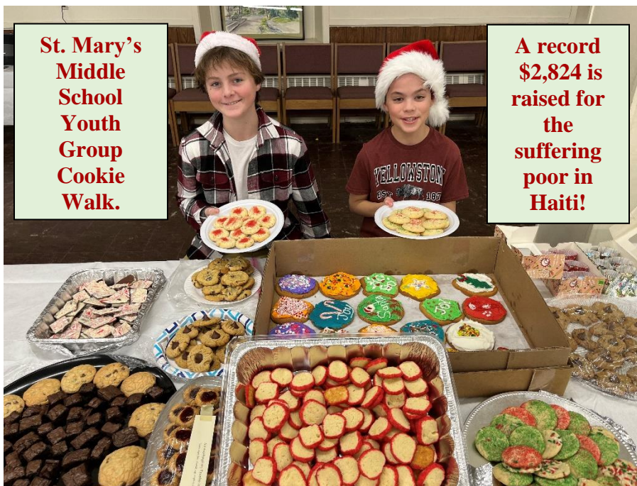
St. Mary's Middle School Youth Group Cookie Walk.