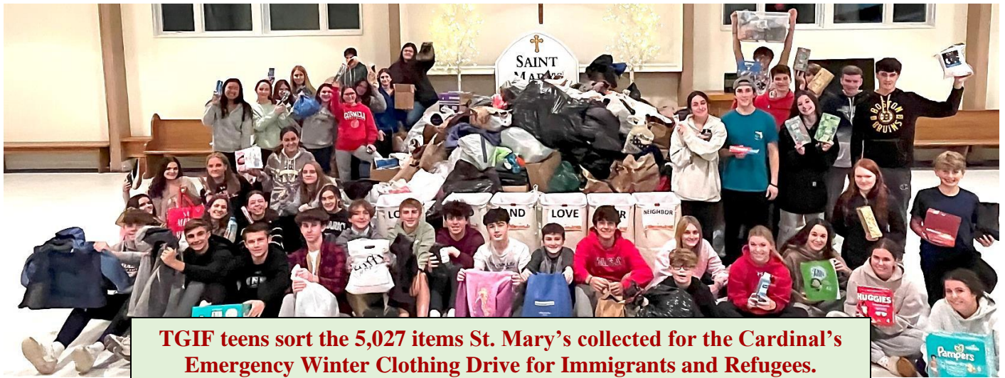
TGIF teens sort the 5,027 items St. Mary's collected for the Cardinal's Emergency Winter Clothing Drive for Immigrants and Refugees.