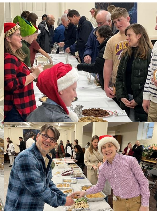
A record $2,824 is raised for the suffering poor in Haiti!