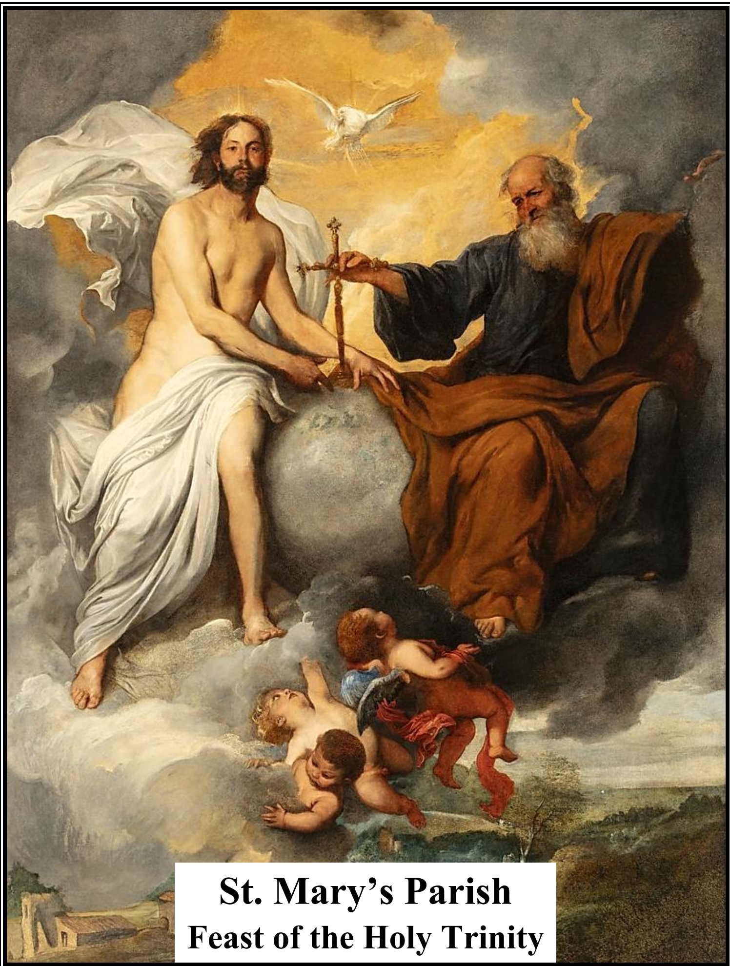
St. Mary's Parish Feast of the Holy Trinity