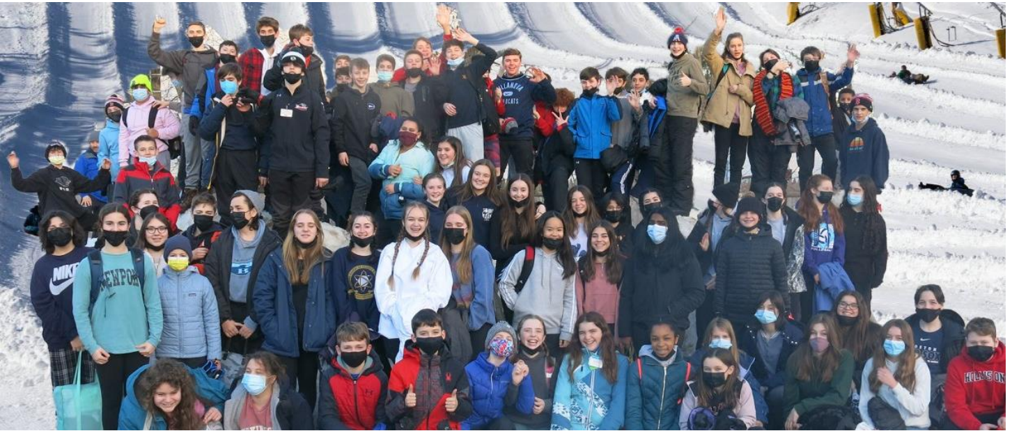
Ninety-three St. Mary's Middle School Youth Group teens hit the slopes of Nashoba on Friday, Feb. 11 for this year's annual Snowtubing Trip. God was good, and we had warm temperatures with fast, icy runs – a very unusual combination! Teens hurtled down the runs solo or in pairs, with dinner eaten outdoors on picnic tables. Thank you to all who made this such a great night of fun and friendship! “Have you visited the place where the snow is kept?” - Job 38:22