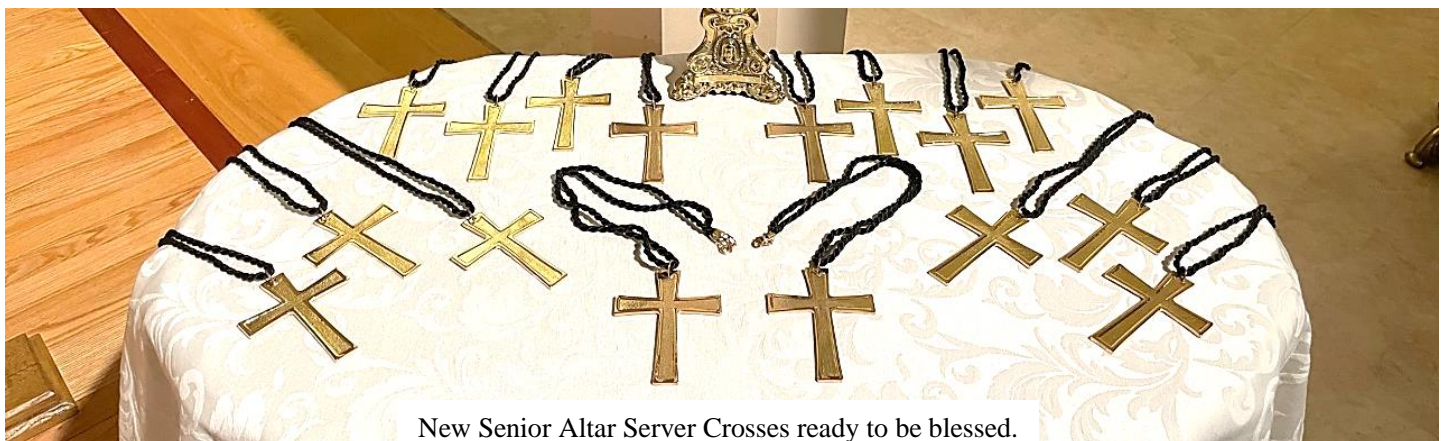
New Senior Altar Server Crosses ready to be blessed.