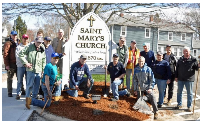
The Holy Saturday Knight's Mulching Crew!