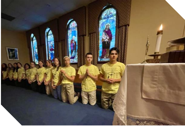
Teens kneeling in the chapel at the Retreat Center

Discovering Christ while serving our neighbors in Mississippi